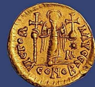
Solidus of King Theudebert (533-548) emulating Byzantine models, Deutsche Bundesbank Frankfurt a. M.