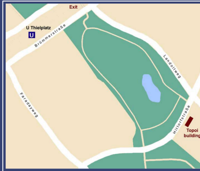
Freie Universität Berlin Topoi Building Dahlem, Hittorfstraße 18, 14195 Berlin

The conference aims to study the Merovingian kingdoms in a broader Mediterranean context. In addition to being deeply rooted in the traditions and practices of the Western Roman Empire, Merovingian Gaul had complex and multi-layered economic, cultural, religious and political relations with the Byzantine and Islamic worlds. By analyzing Western and Eastern sources as well as archeological findings, the symposium seeks to offer a new perspective on the Merovingian period.