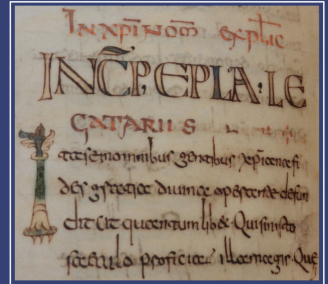
Letter from the church of Milan to Frankish envoys headed to Constantinople (ca. AD 551/552), Berlin, SBPK Phill. 1743, fol. 248 r