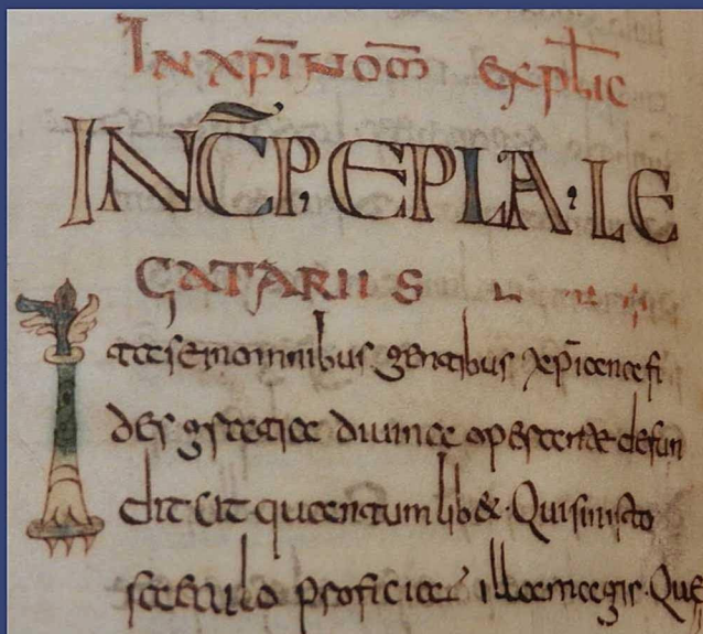
Letter from the church of Milan to Frankish envoys headed for Constantinople (ca. AD 551/552) Epistula legataris , Codex Remensis, Berlin, Staatsbibliothek, Ms. Phill. 1743, fol. 284 v

The conference aims to study the Merovingian Kingdoms in a broader Mediterranean context. In addition to being deeply rooted in the traditions and practices of the Western Roman Empire, Merovingian Gaul had complex and multi-layered economic, cultural, religious and political relations with the Byzantine and Islamic worlds. By analyzing Western and Eastern sources as well as archeological findings, the symposium seeks to offer a new perspective on the Merovingian period.