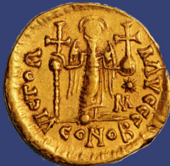
Solidus of King Theudebert I (AD 533–548) emulating Byzantine models, Deutsche Bundesbank, Frankfurt am Main

The conference aims to study the Merovingian kingdoms in a broader Mediterranean context. In addition to being deeply rooted in the traditions and practices of the Western Roman Empire, Merovingian Gaul had complex and multi-layered economic, cultural, religious and political relations with the Byzantine and Islamic worlds. By analyzing Western and Eastern sources as well as archeological findings, the symposium seeks to offer a new perspective on the Merovingian period.