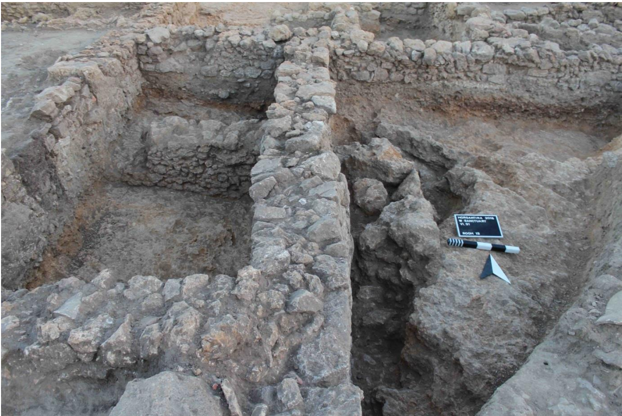
W part of room 13 and room 12, from S: early wall with EW stretch visible to the left (in room 12) and with NS stretch visible to the right (in room 13)

Excavation of the entire room down to bedrock showed that the E-W wall identified in room 12 in 2015 actually belongs to an earlier structure: it continues into room 13 and turns south at a right angle. The structure is placed directly onto bedrock and must predate the W wall of room 13.