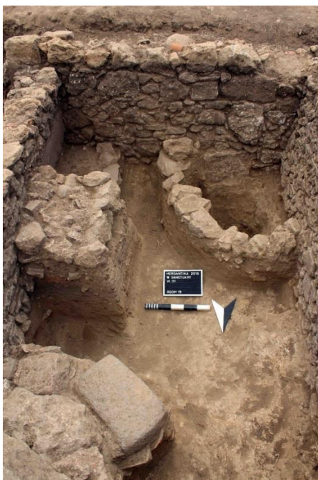
Room 19, from N: well in SW corner; second phase cooking platform SE corner; third phase platform along E wall

Aside from room 18, partially excavated in 2015, this room was the only room in the “West Sanctuary” building that had an intact tile fall, identified beneath the bottom levels of disturbed top soils. Room 19 and the adjacent eastern room 20 originally formed one large room, which was subdivided into the narrow room 19 and the larger corner room 20 in a second phase. Room 19 includes a small rock-cut well in the SW corner, which is the only water supply in the entire building. In the second phase, room 19 was used as a kitchen with a cooking surface in the SE corner and cooking ware dump in the NW. After the second phase, the level in the room was raised twice, the cooking surface was covered, and a new stone surface / platform (of unknown function) was constructed against the central part of the E wall. In these last two phases, the well went out of use, and it remains unclear how the building was then supplied with water.