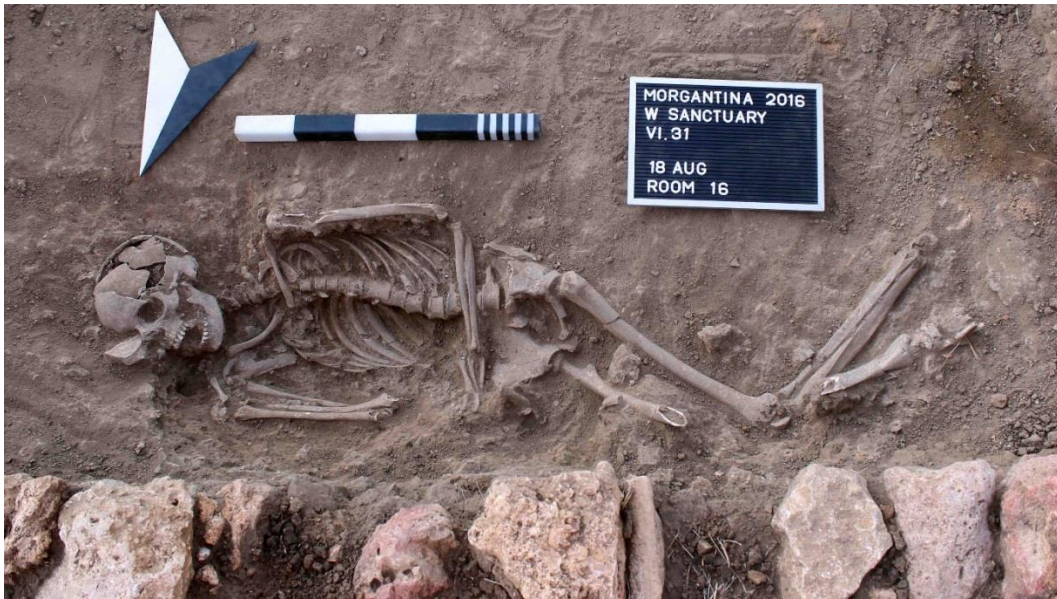
Room 16, Skeleton in NW corner, from N.