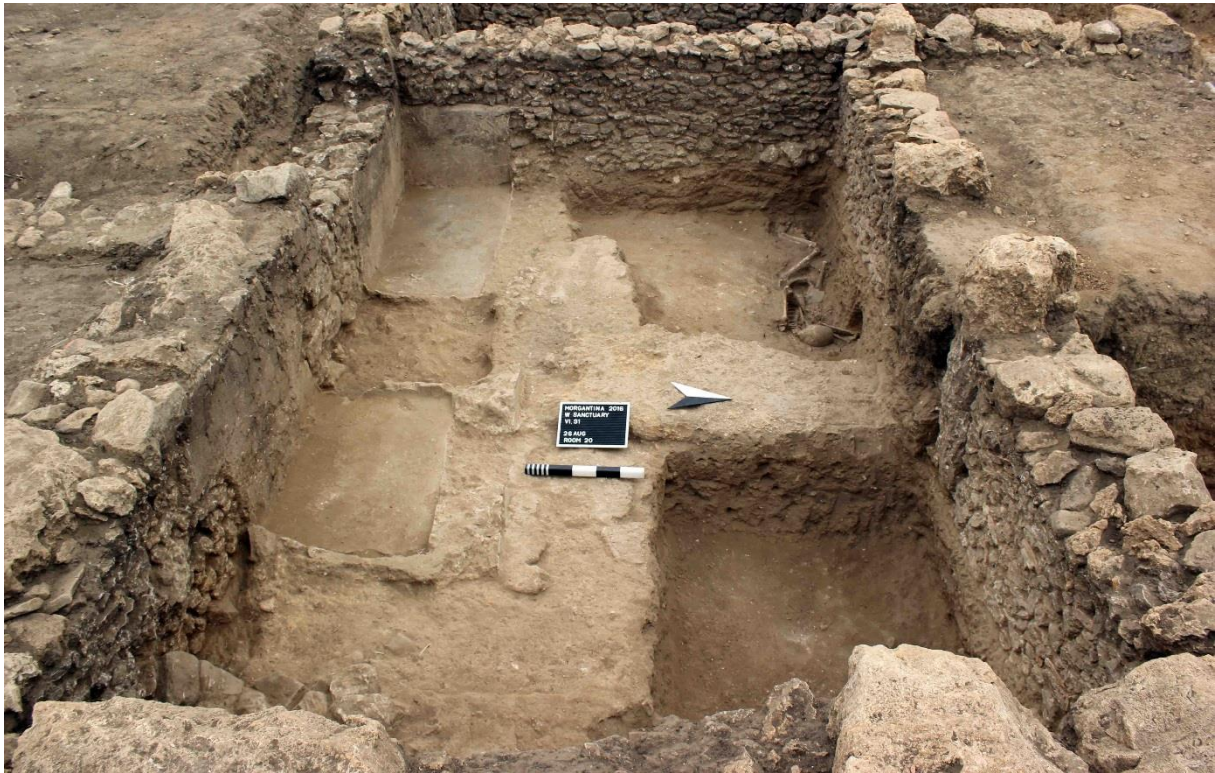
Room 20, view from E: two opus signinum basins along S wall, burial in NW corner

In the NW corner of this room, a second burial, very similar to the burial in room 16, was found; the skeleton was lying on its right with angled legs, with the head in the E looking N. The left arm was lying over the stomach, while the right arm and hand were angled to cover the lower skull. As in room 16, there were no associated finds with this skeleton.