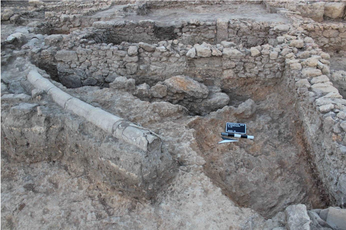
Room 13, from E: terracotta pipes