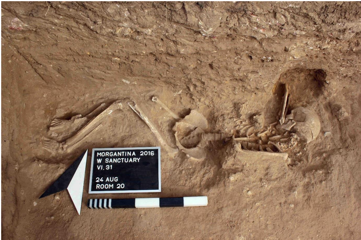
Room 20, Skeleton in NW corner, from S

As a result of research in 2016, the building is now understood in full.